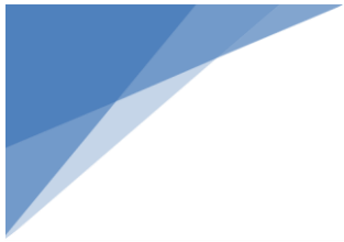
APPENDIX 1 Table showing Board election timeframe