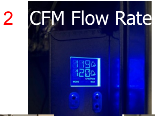
2 CFM Flow Rate