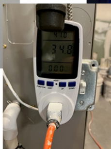
kWH Usage 1