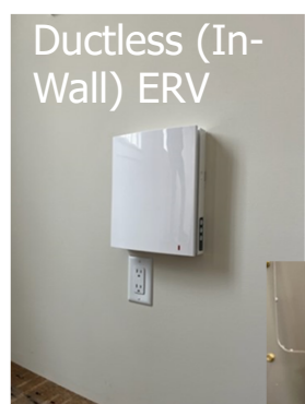
Ductless (In-Wall) ERV