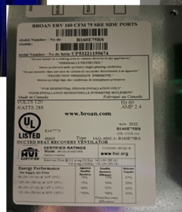
Sensible Heat Recovery 3